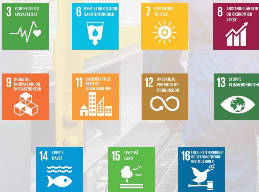
Illustration: UN sustainable development goals

The UN sustainable development goals have been central to the strategy work, with a particular focus on the following: